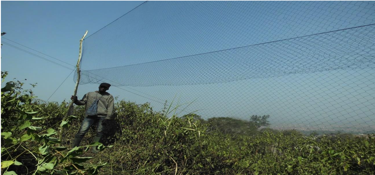
Fig. (1). Basic set-up of a mist net placed on a side of the Abobo-Etetak hill.

We began our capture very early in the morning (5: 00 AM) and we finished very late in the evening (sometimes 6: 30 PM). We used the same eight mist nets in our different field study and we did nine field studies during eight months.